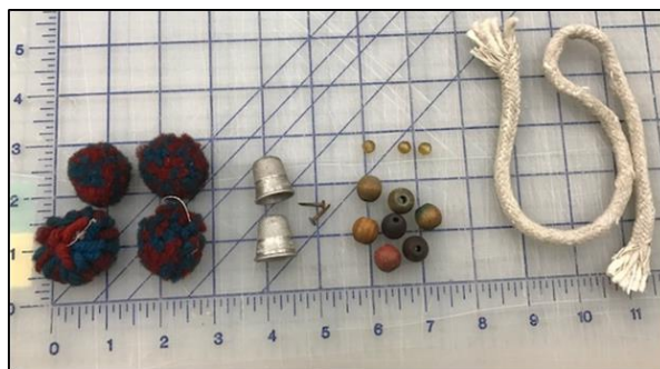
NMAI 253563.012 Dream Dance Drum fragments