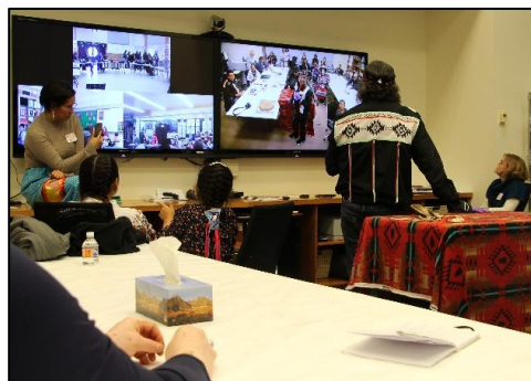
Alexis Nakota Sioux Nation tribal members consulting with community members on ceremonial and utilitarian objects from three remote