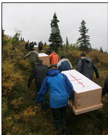
Igiugig community members and guests carrying ancestral remains to a former cemetery site.