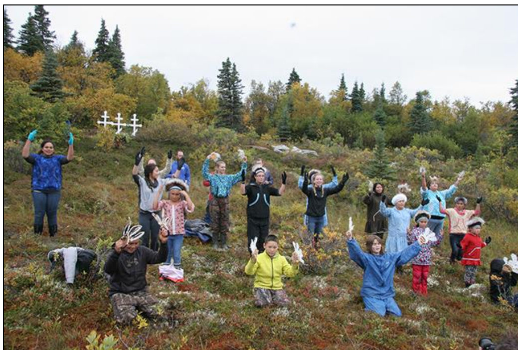
Blessing songs performed by the Igiugig Yup'ik dance group.